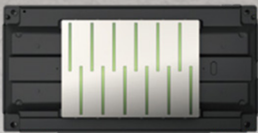
PrecisionCore Micro TFP printhead