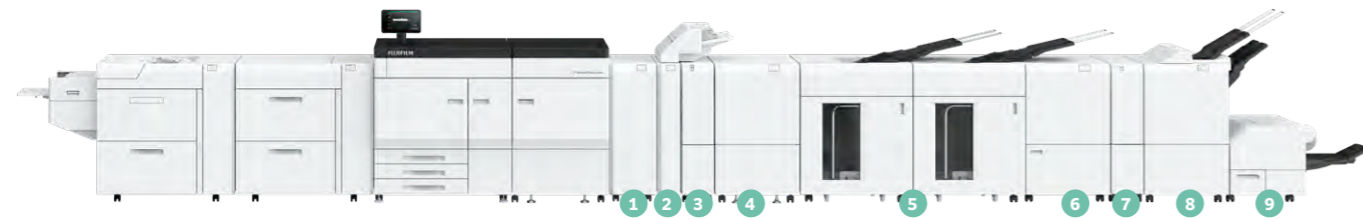
Full Configuration: W 10462 x D 1104 x H 1786 mm